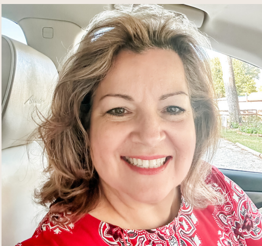
TEAM MEMBER NAME Title or Role

Pine Lake Ranch, a family-owned wedding and event venue blends stunning natural beauty and personalized care for events up to 250 guests. Our dedication to service and family values are at the heart of everything we do, ensuring each couple feels uniquely cherished. ♥